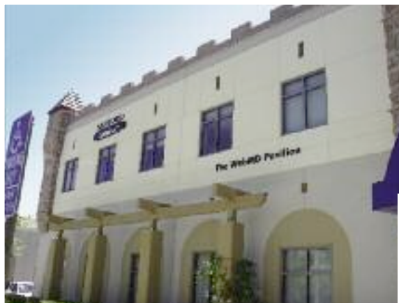
Castle of Care

The ACP added 154 beds to Rady Children's, making our Hospital the largest children's hospital in California.