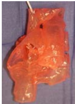
3-D printed model of the patient's heart (actual size)

An article on the case was published in the Aug. 8 issue of the Journal of the American College of Cardiology .