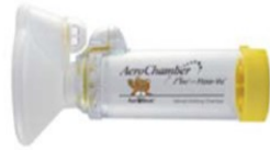
A typical spacer with a mask looks like this

Your child should always use a spacer whenever they use a metered dose inhaler. If a spacer is not used, much of the medicine may end up on the tongue, in the back of the throat, or in the air. A spacer holds the medicine in its chamber long enough for your child to inhale slowly.