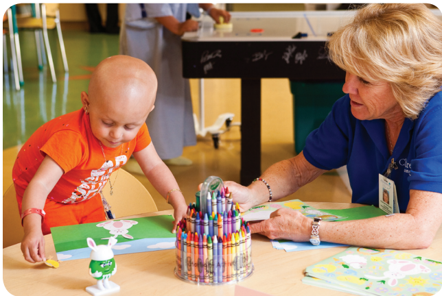
A hematology/oncology patient at play.