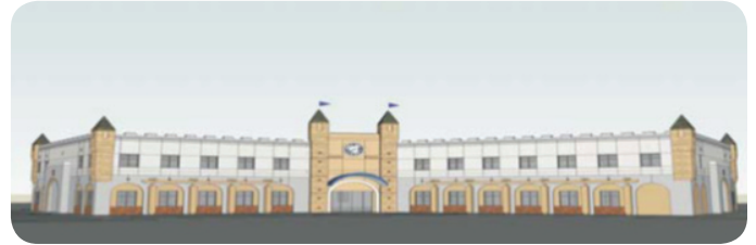
Rady Children's Sanford Clinic

In collaboration with Rady Children's Hospital, Rady Children's Specialists, Children's Primary Care Medical Group and Sanford Health, a "Castle of Care" will open for business on Monday, April 4, 2011 .