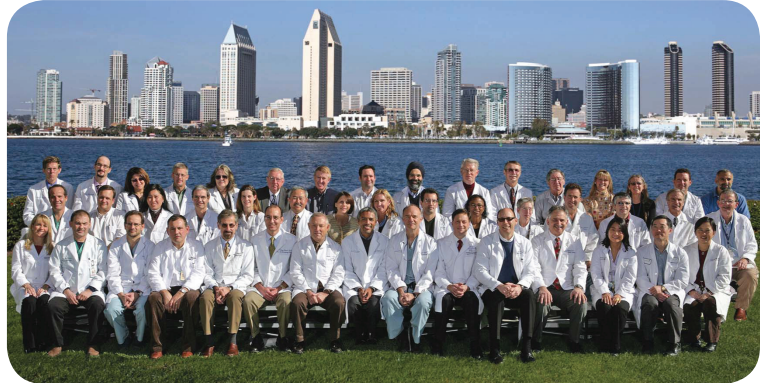
CSSD Physicians 2008

Location: Scripps La Jolla The Schaetzel Center