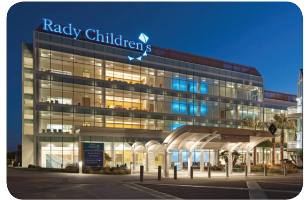
Rady Children's new Acute Care Pavilion opened 10/10/10

On October 10, 2010, Rady Children's opened its brand new 279,000 square foot, LEED-certified Acute Care Pavilion. The entire second floor of the Acute Care Pavilion became home to the Peckham Center, including the Viterbi Family Outpatient Clinic. With 12 outpatient exam rooms, 38 private inpatient rooms and advanced HEPA air filtration system, risks of infection are greatly reduced for our most vulnerable chemotherapy patients and their families. And the new Carley's Magical Garden, constructed to reduce the risk of infection from germs and mold, helps to create an incredible healing environment.