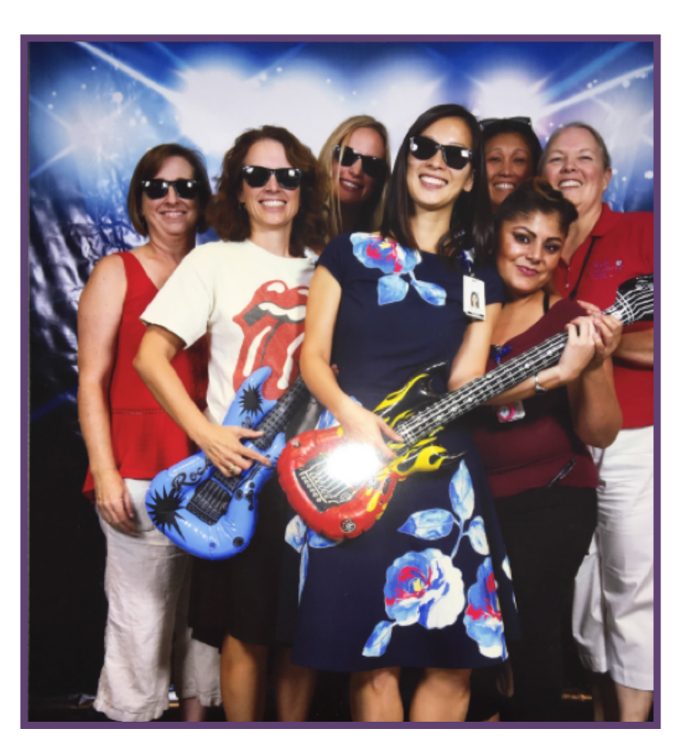
HEMOPHILIA & THROMBOSIS Spring 2018 | 6