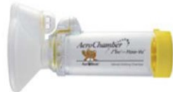
A typical spacer with a mask looks like this

Your child should always use a spacer whenever they use a metered dose inhaler. If a spacer is not used, much of the medicine may end up on the tongue, in the back of the throat, or in the air. A spacer holds the medicine in its chamber long enough for your child to inhale slowly.