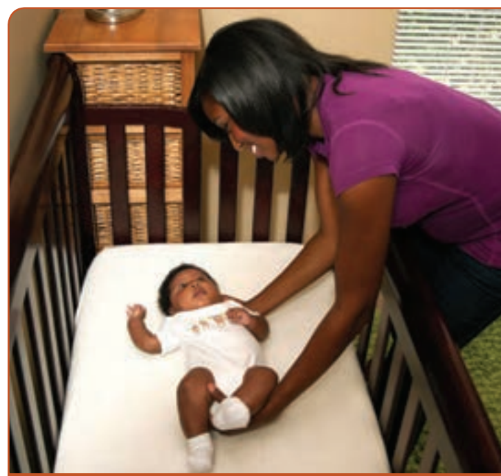
Always place your baby on his or her back to sleep, for naps and at night.