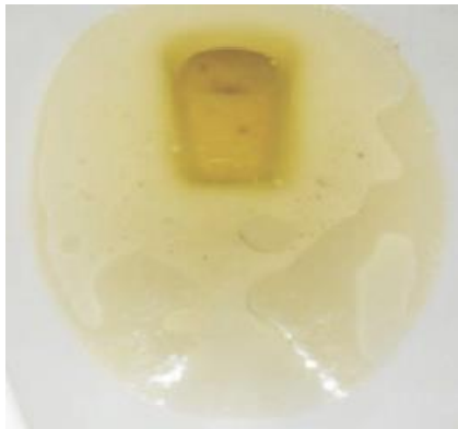
Great bowel prep. Yellow & clear.

By 3 PM , if stools are NOT a clear liquid ( See Great bowel prep photo below ) Call 858-966-4003 (option 3) to discuss with GI nurse.