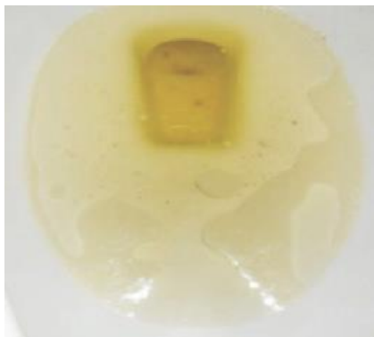
Great bowel prep. Yellow & clear.

Call 858-966-4003 (option 3) to discuss with GI nurse.