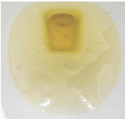
Great bowel prep. Yellow & clear.

By 3 PM , if stools are NOT a clear liquid (See Great bowel prep photo below) Call 858-966-4003 (option 3) to discuss with GI nurse.