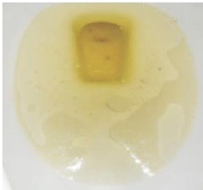
Great bowel prep. Yellow & clear.

By 3 PM , if stools are NOT a clear liquid ( See Great bowel prep photo below ) Call 858-966-4003 (option 3) to discuss with GI nurse.