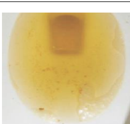
Almost there. Keep going. Yellow & clear with small particulate matter.