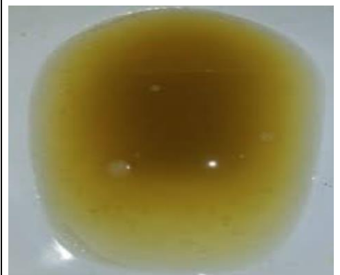
Not clear. Keep going. Cannot see bottom of toilet bowl.