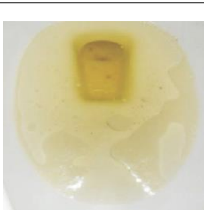
Great bowel prep. Yellow & clear.

By 3 PM , if stools are NOT a clear liquid (See Great bowel prep photo below) Call 858-966-4003 (option 3) to discuss with GI nurse.