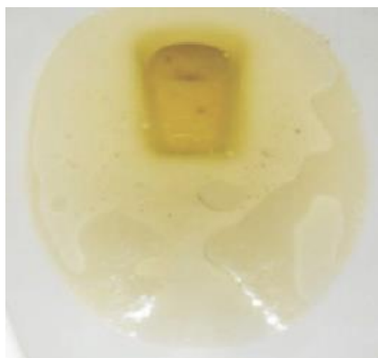
Great bowel prep. Yellow & clear.

By 3 PM , if stools are NOT a clear liquid (See Great bowel prep photo below) Call 858-966-4003 (option 3) to discuss with GI nurse.