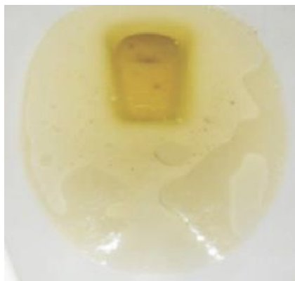
Great bowel prep. Yellow & clear.

Call 858-966-4003 (option 3) to discuss with GI nurse.