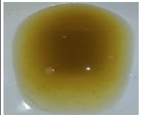
Not clear. Keep going. Cannot see bottom of toilet bowl.