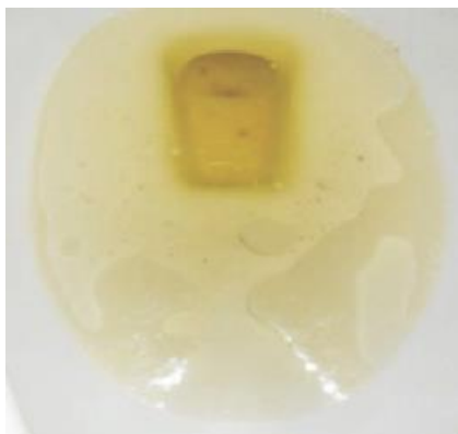
Great bowel prep. Yellow & clear.

Call 858-966-4003 (option 3) to discuss with GI nurse.