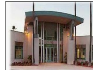
11732 El Camino Real, San Diego, CA 92130