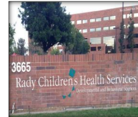
3665 Kearny Villa Road, San Diego, CA 92123