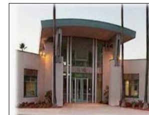
11732 El Camino Real, San Diego, CA 92130