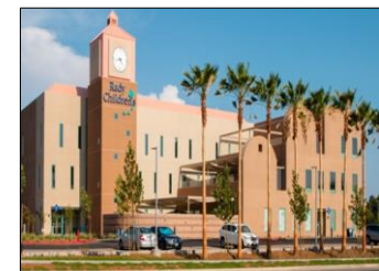
25170 Hancock Avenue Murrieta, CA 92562