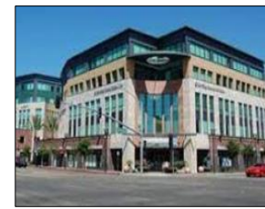
333 H Street Chula Vista, CA 91910