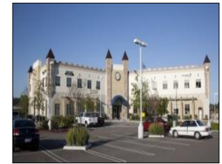
3605 Vista Way, Oceanside, CA 92056