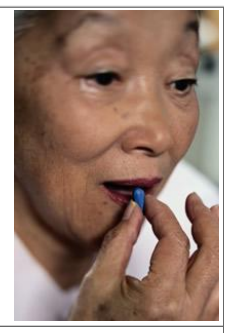
The best way to control lupus is to get involved in your care. Take all medications as your doctor prescribed, and visit your physician often. Learn as much as you can about lupus and your medications.