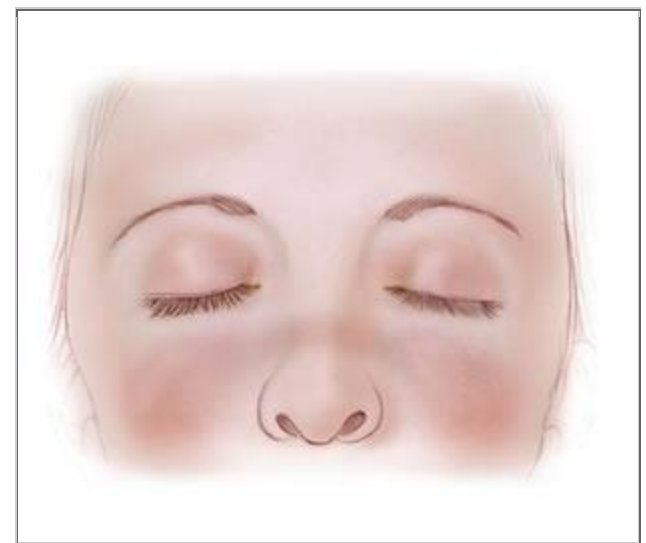
This picture shows a malar rash, a red rash on the cheeks and nose. This rash often results from sun exposure.

The American College of Rheumatology has a list of symptoms and other measures that doctors can use as a guide to decide if a patient with symptoms has lupus. If your doctor finds that you have at least four of these problems, and finds no other reason for them, you may have lupus: